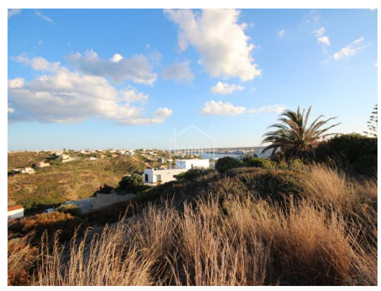
The information shown is provided by third parties for information only and are assumed correct. The data are subject to errors, price changes and withdrawal without notice.