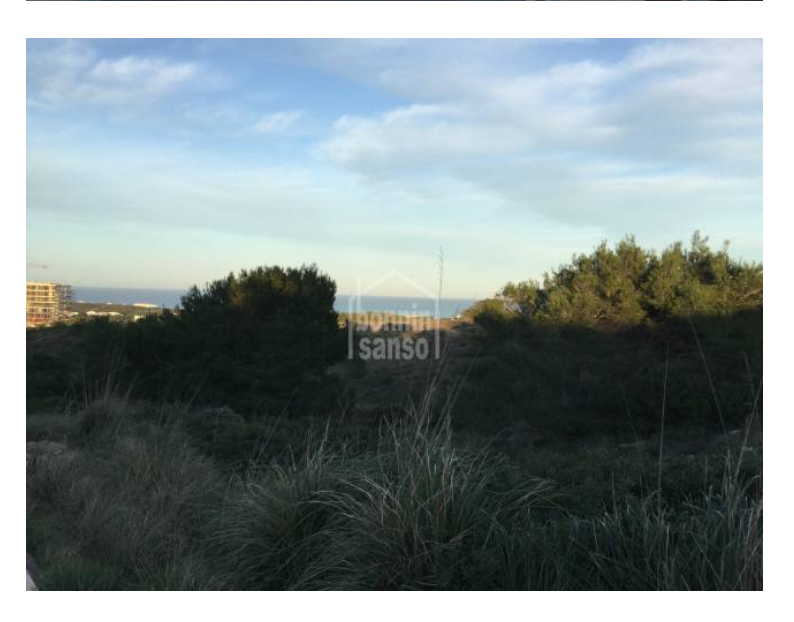
The information shown is provided by third parties for information only and are assumed correct. The data are subject to errors, price changes and withdrawal without notice.