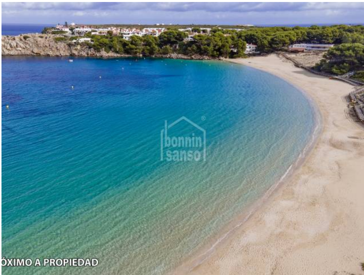
PRÓXIMO A PROPIEDAD

The information shown is provided by third parties for information only and are assumed correct. The data are subject to errors, price changes and withdrawal without notice.