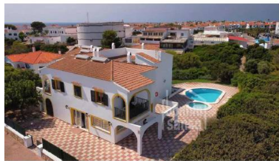
NORAY EDIFICIO RESIDENCIAL