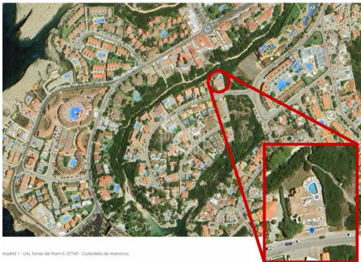
Madrid 1 - Urb. Torres del Ram III, 02769 - Ciudadela de Menorca.