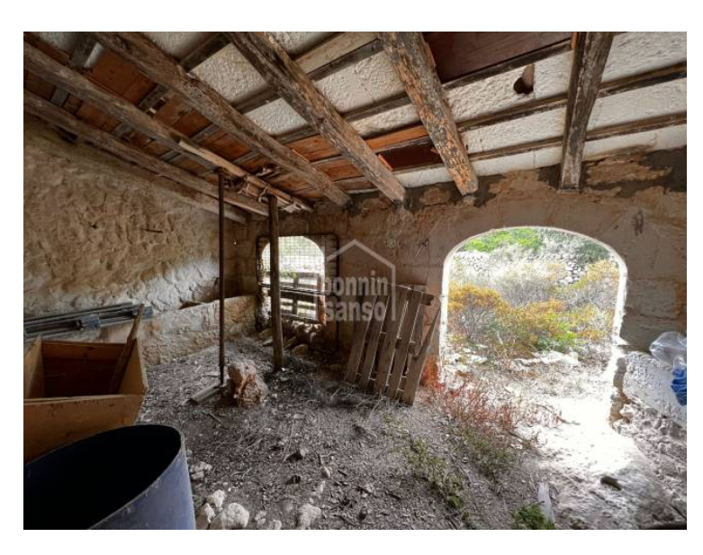
The information shown is provided by third parties for information only and are assumed correct. The data are subject to errors, price changes and withdrawal without notice.