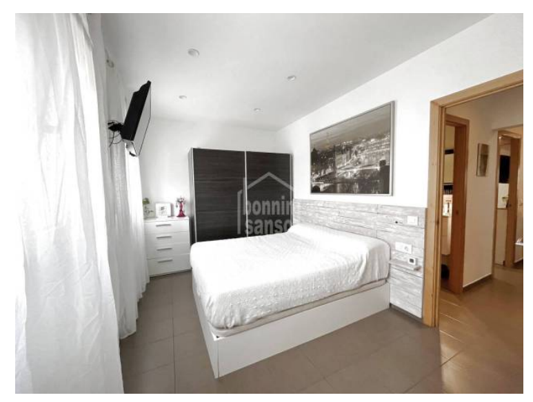
The information shown is provided by third parties for information only and are assumed correct. The data are subject to errors, price changes and withdrawal without notice.