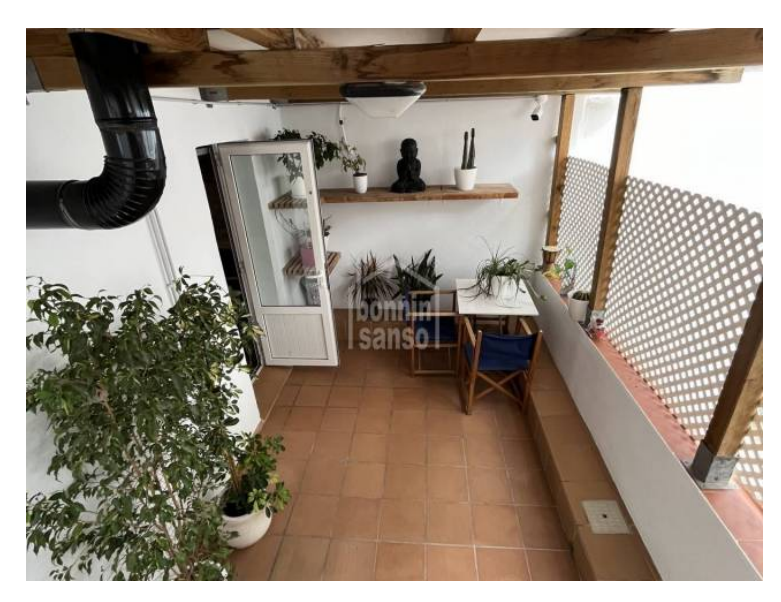
The information shown is provided by third parties for information only and are assumed correct. The data are subject to errors, price changes and withdrawal without notice.