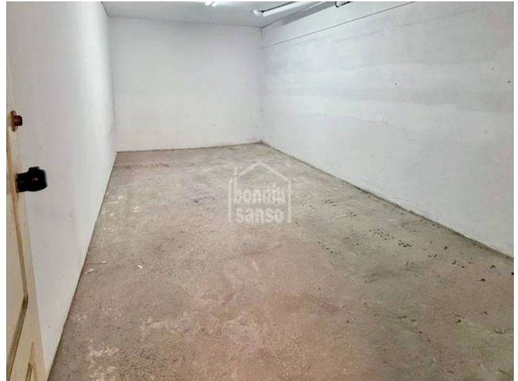
Planta 0: No Idenificat, No identificat