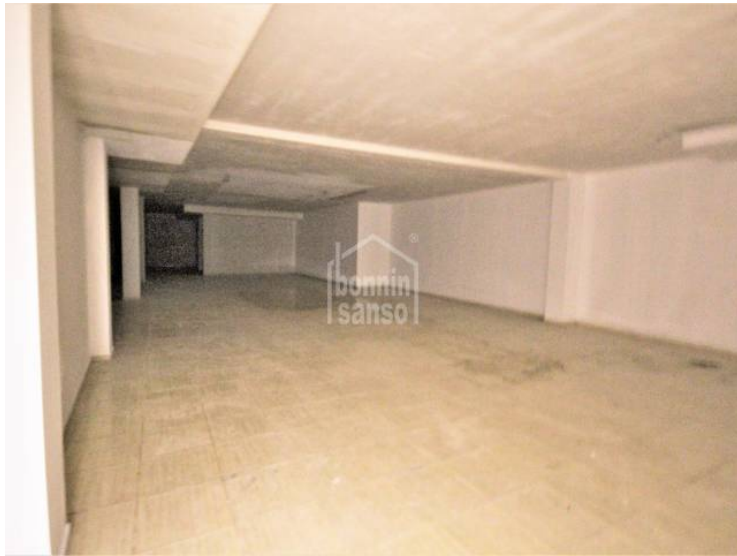
PLANOS LOCAL COMERCIAL: